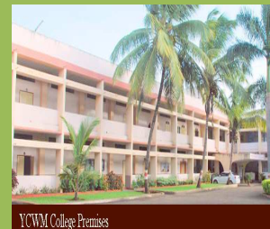
YCWVM College Premises