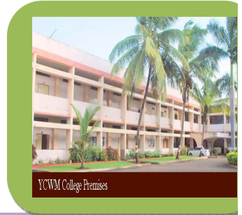
YCWVM College Premises