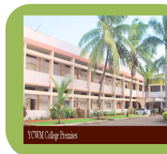
YCWVM College Premises