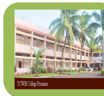
YCWVM College Premises