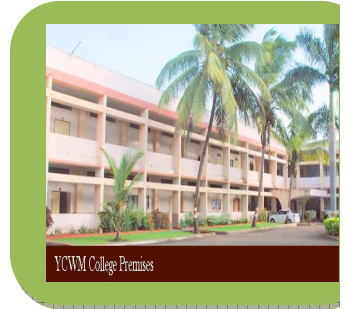
YCWVM College Premises