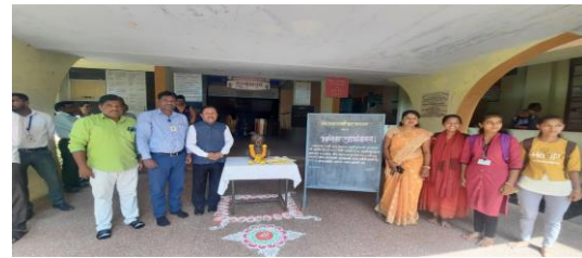
06.05.2022: Celebration of 100 th Commemoration Day Anniversary of Rajarshi Chhatrapati Shahu Maharaj