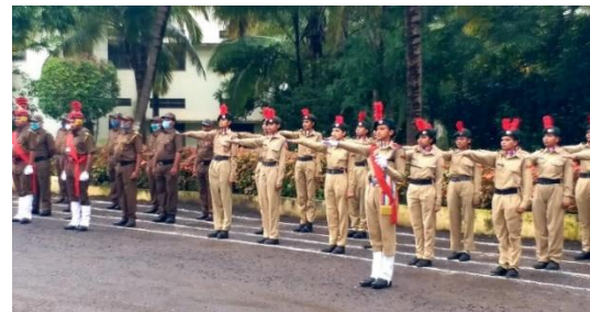
15.08.2021: Celebration of Independence Day