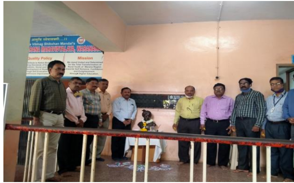
26.06.2021: Birth anniversary of Chhatrapati Rajarshi Shahu Jayanti