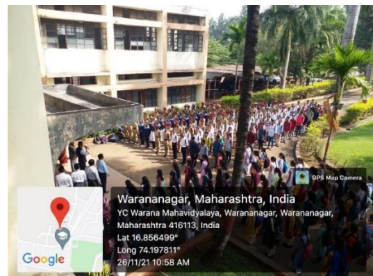
26.11.2021: Celebration of Samvidhan Din