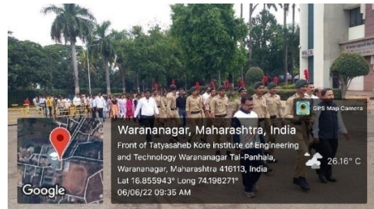
06.06.2022: Shivswarajya Day (Chhatrapati Shivaji Maharaj Rajyabhishek Din)