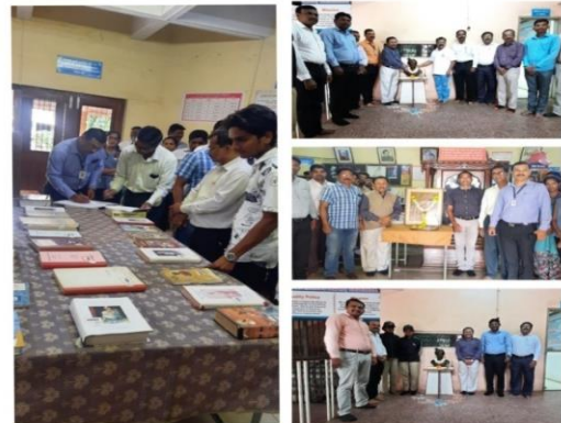
26.06.2022: Chhatrapati Rajarshi Shahu Jayanti (and Book exhibition)