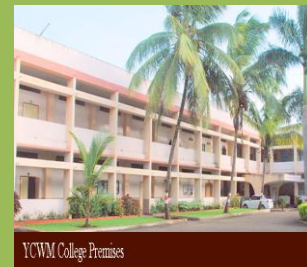
YCWM College Premises