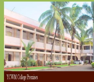
YCWM College Premises