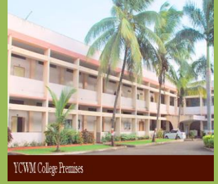
YCWM College Premises