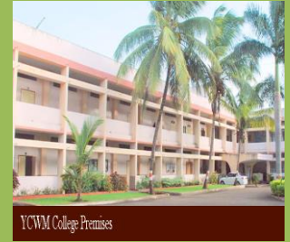
YCWM College Premises