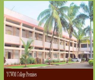
YCWM College Premises