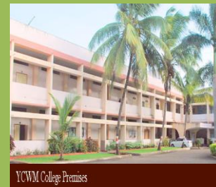
YCWM College Premises